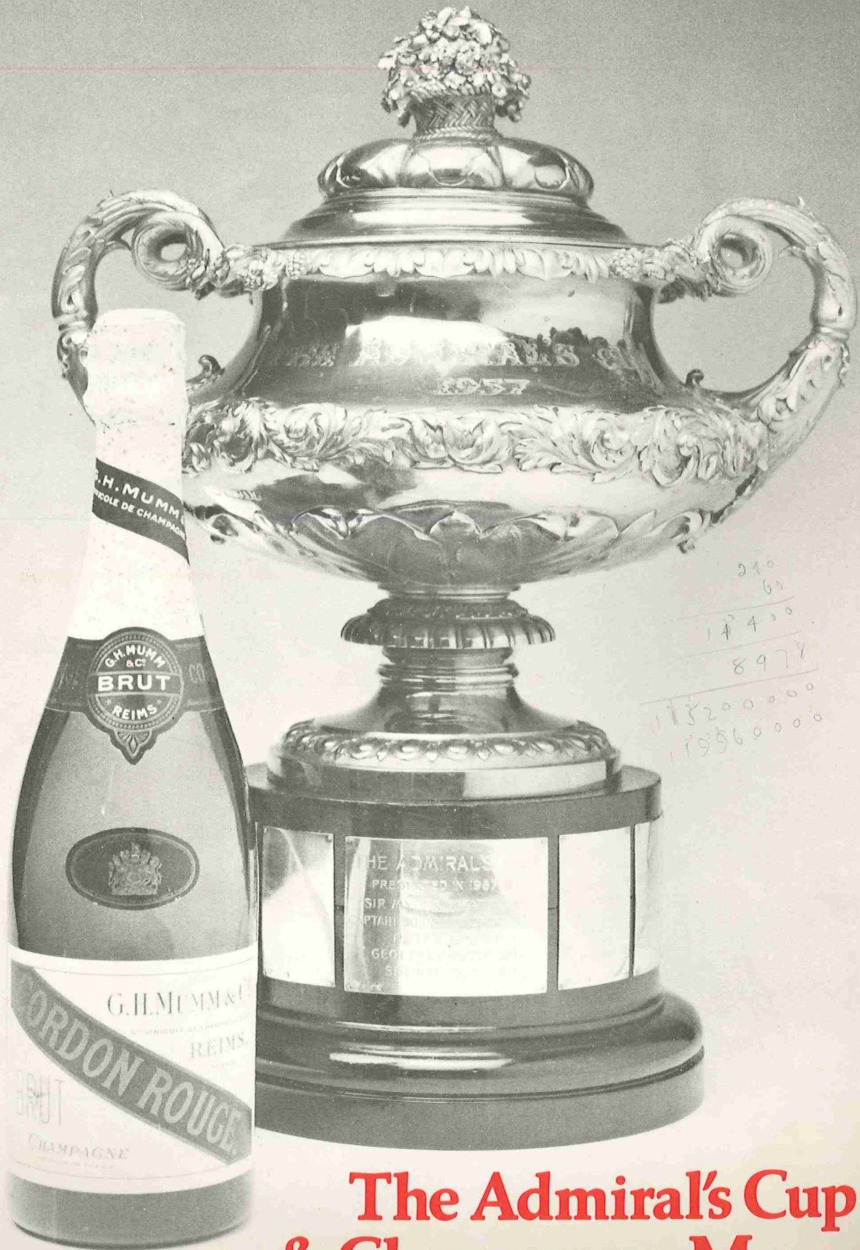
The Admiral's Cup & Champagne Mumm